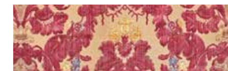
Pink Velvet Garden